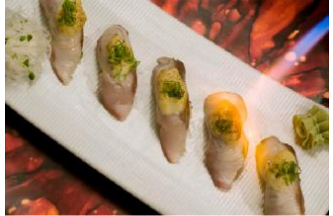
The new menu contains the popular Torched Sushi and Sushi Menu